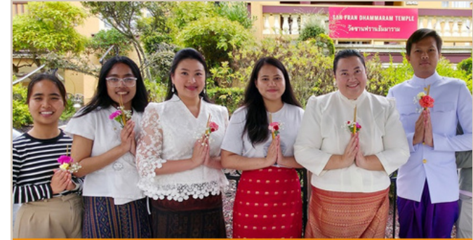
Thank you for your hard work and dedication

Wat San Fran Summer School began on June 9. Over the summer, the children learned Thai music, culture, and most importantly the foundations of Buddhism. They also enjoyed helping around the temple and learning how to show respect to monks and elders. We love watching the children grow both in knowledge and experience.