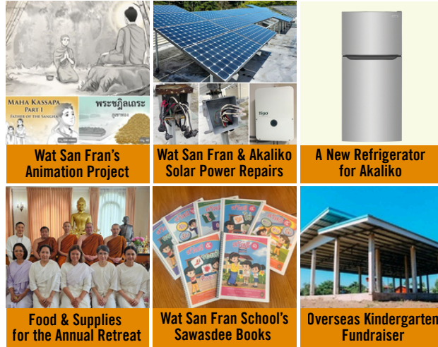
Wat San Fran's Animation Project